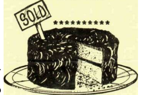
Caramel Layer Chocolate Squares